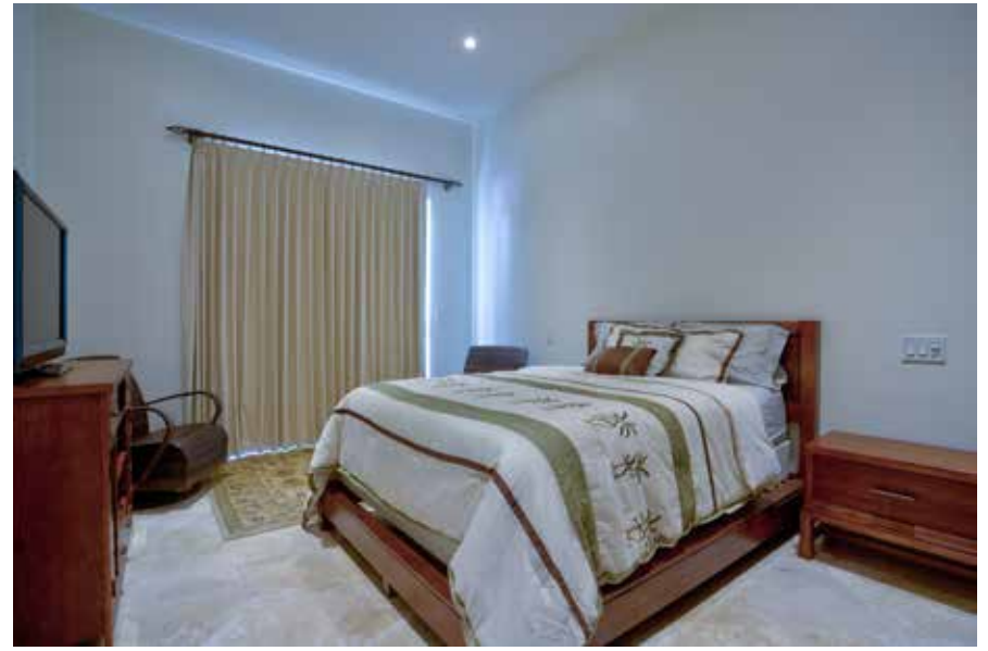
Guest Bedroom 1