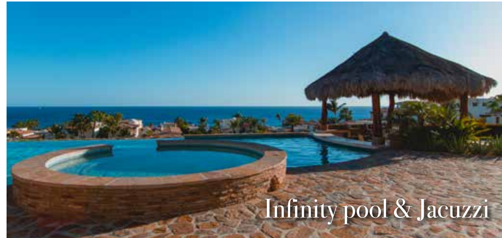
Infinity pool & Jacuzzi