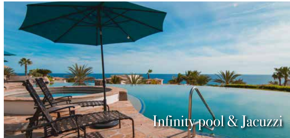
Infinity pool & Jacuzzi