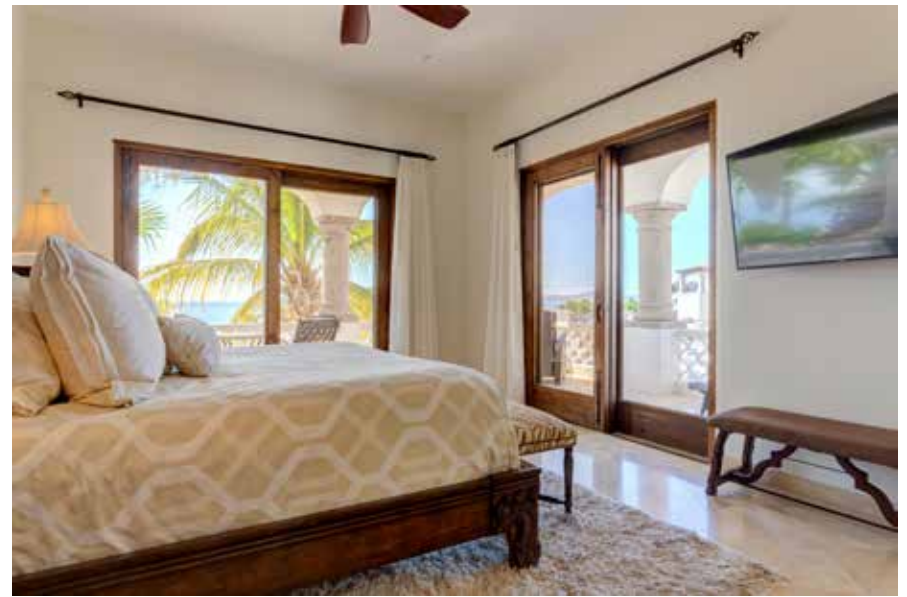
Master Bedroom 2