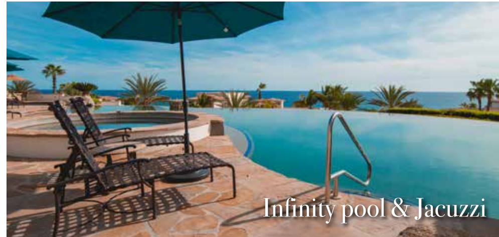
Infinity pool & Jacuzzi