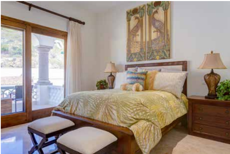
Guest Bedroom 1