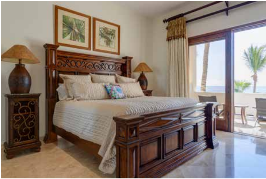
Master Bedroom 1