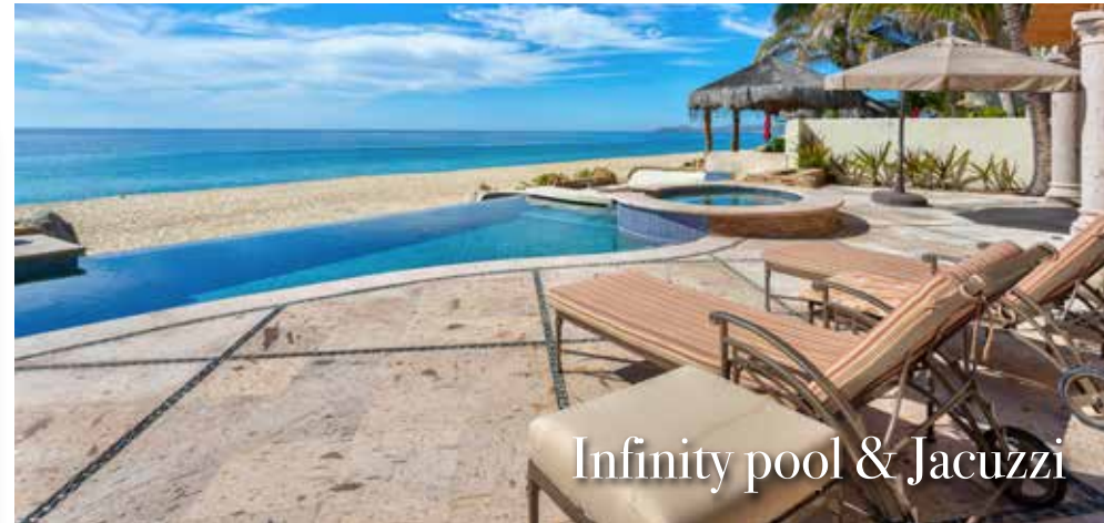
Infinity pool & Jacuzzi