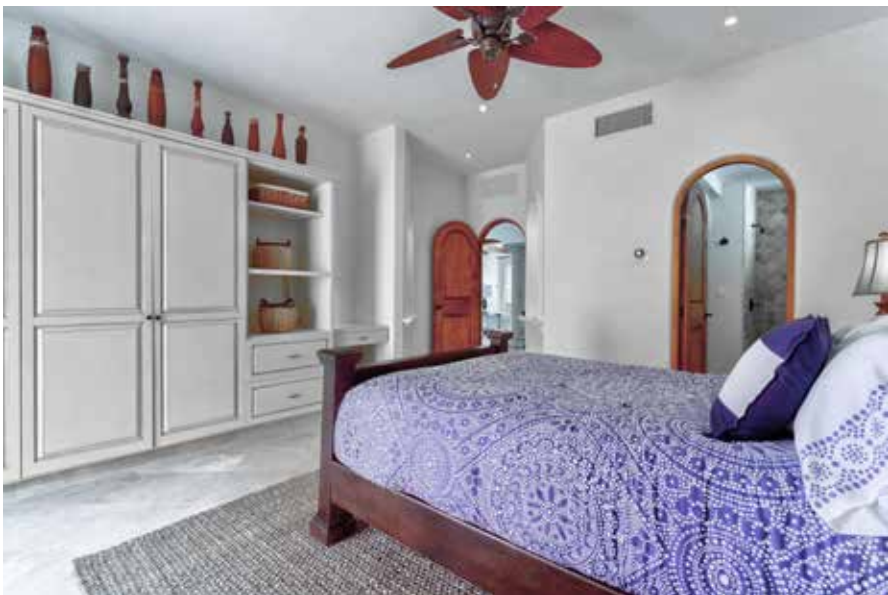
Downstairs Guest Bedroom