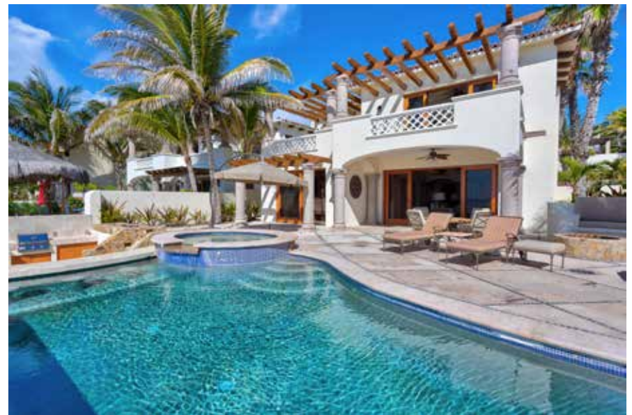
Backyard / Pool Area