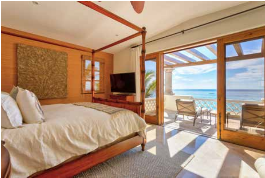
Upstairs Master Bedroom