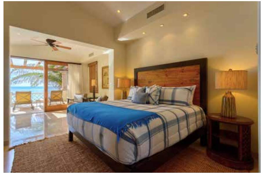
Upstairs Master Bedroom 2