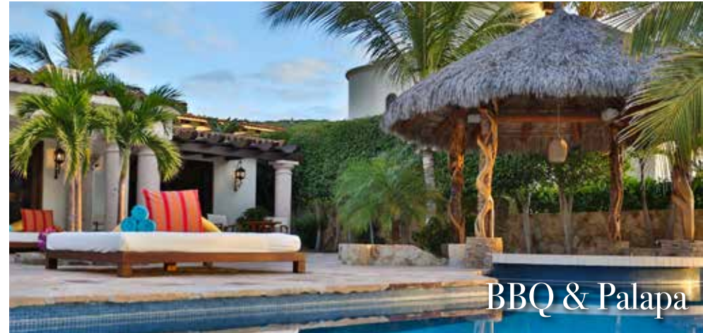
BBQ & Palapa