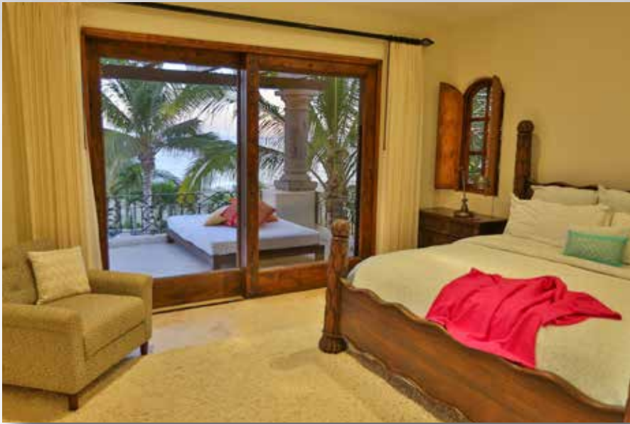
Upstairs Master Bedroom