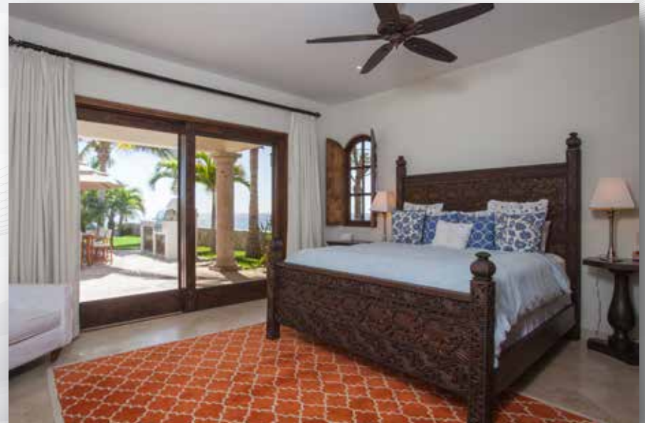
Downstairs Master Bedroom