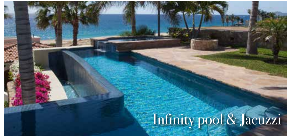
Infinity pool & Jacuzzi