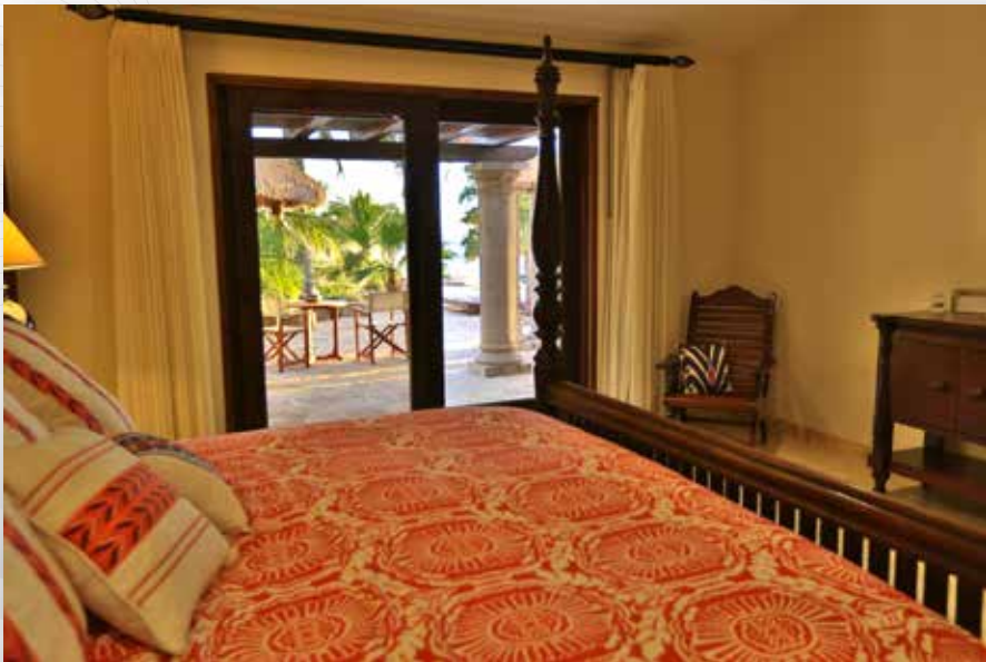
Downstairs Guest Bedroom